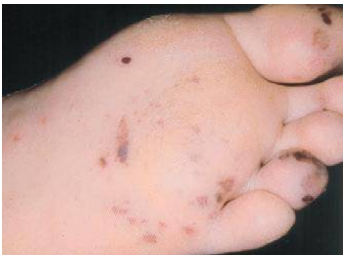
FIGURE 76e-56 Septic emboli, with hemorrhage and infarction due to acute Staphylococcus aureus endocarditis.