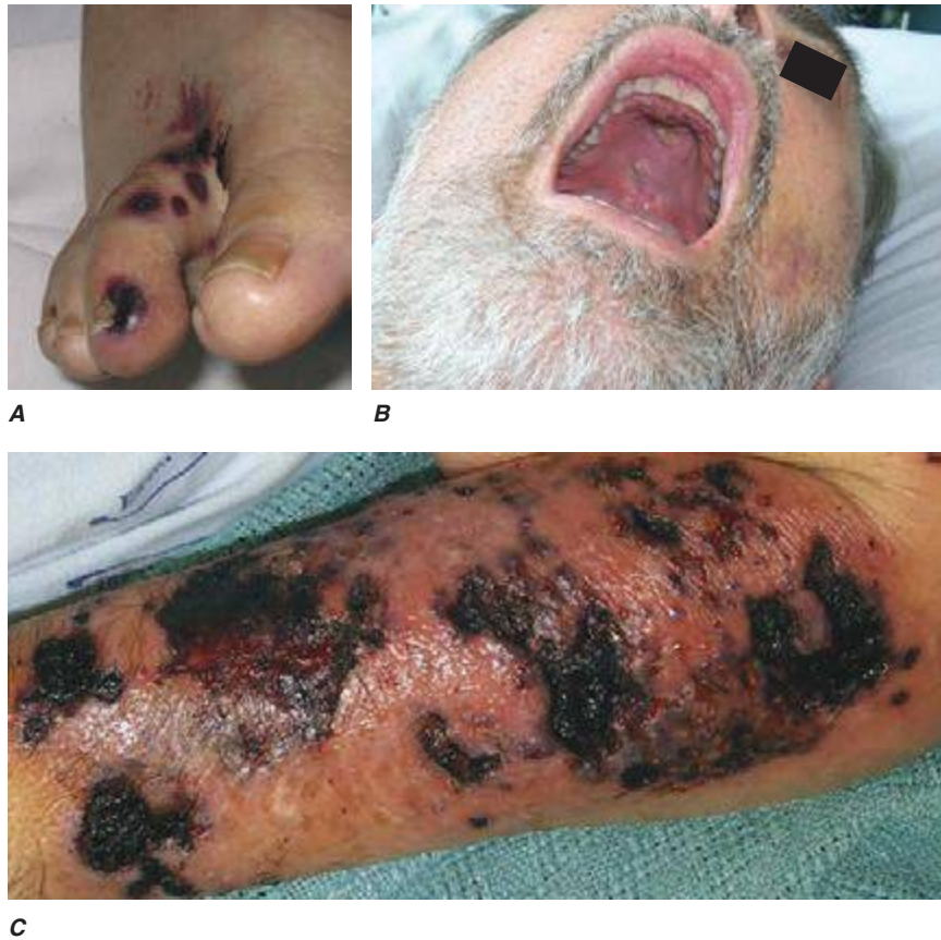
FIGURE 76e-55 Skin lesions of neutropenic patients. A. Hemorrhagic papules on the foot of a patient undergoing treatment for multiple myeloma. Biopsy and culture demonstrated Aspergillus species. B. Eroded nodule on the hard palate of a patient undergoing chemotherapy. Biopsy and culture demonstrated Mucor species. C. Ecthyma gangrenosum in a neutropenic patient with Pseudomonas aeruginosa bacteremia.