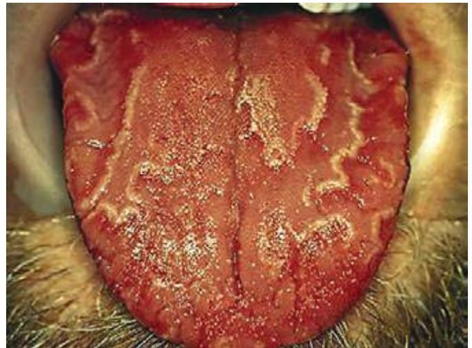
FIGURE 46e-14 Geographic tongue.