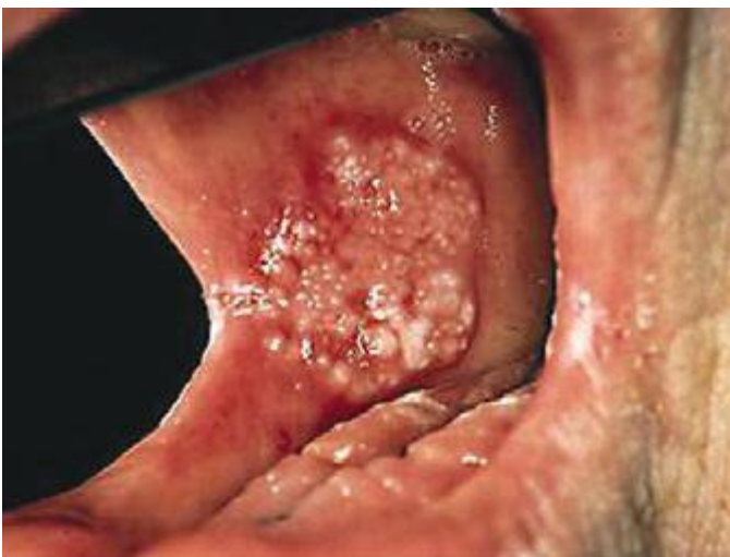
FIGURE 46e-12 Oral carcinoma.