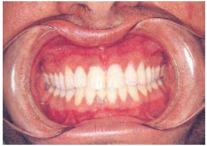
FIGURE 46e-13 Healthy mouth.