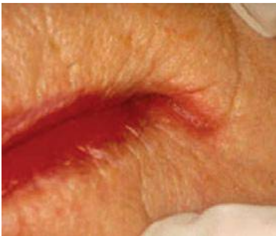
FIGURE 46e-7 Angular cheilitis.