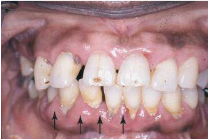
FIGURE 46e-6 Severe periodontitis.