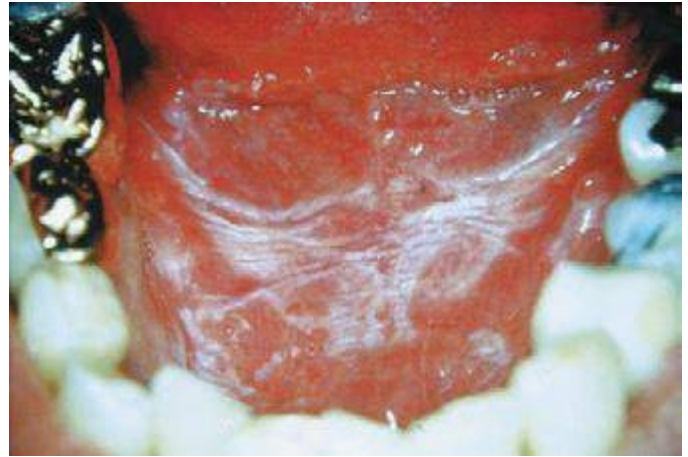
FIGURE 46e-8 Sublingual leukoplakia.