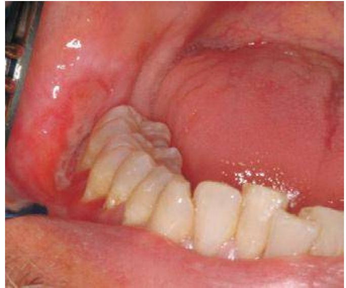
FIGURE 46e-3 Erosive lichen planus.