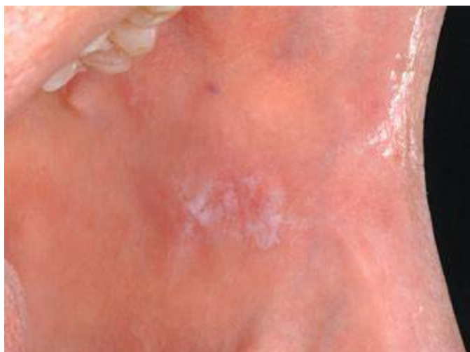
FIGURE 46e-2 Oral lichen planus.