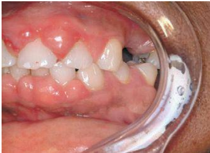
FIGURE 46e-1 Gingival overgrowth secondary to calcium channel blocker use.

The health status of the oral cavity is linked to cardiovascular disease, diabetes, and other systemic illnesses. Thus, examining the oral cavity for signs of disease is a key part of the physical exam. This chapter presents numerous outstanding clinical photographs illustrating many of the conditions discussed in Chap. 45 , Oral Manifestations of Disease. Conditions affecting the teeth, periodontal tissues, and oral mucosa are all represented.