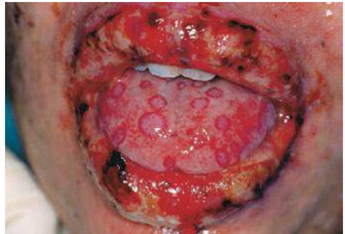
FIGURE 46e-4 Stevens-Johnson syndrome—reaction to nevirapine.