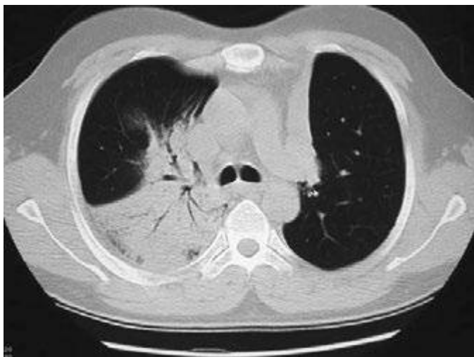
FIGURE 386e-4 Computed tomography of the chest demonstrating a dense infiltrate with air bronchograms involving a segment of the right upper lobe due to bacterial pneumonia in an immunosuppressed patient with granulomatosis with polyangiitis (Wegener's). Collapse of the left upper lobe secondary to endobronchial stenosis from granulomatosis with polyangiitis (Wegener's) also is seen on this image.