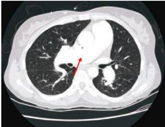
FIGURE 308e-53 CT scan of the same patient as in Fig. 308e-52. Note the markedly enlarged pulmonary arteries ( red arrow ).