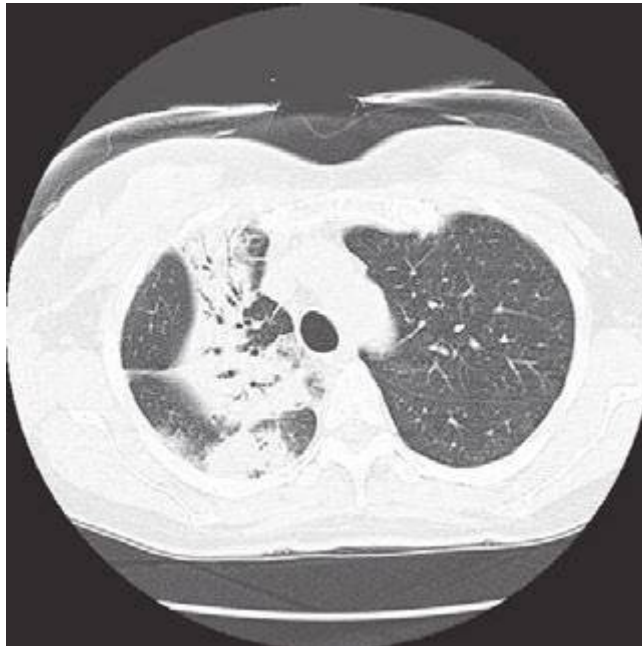
FIGURE 308e-9 CT scan of the same right upper lobe opacity. Note the air bronchograms and areas of consolidation.