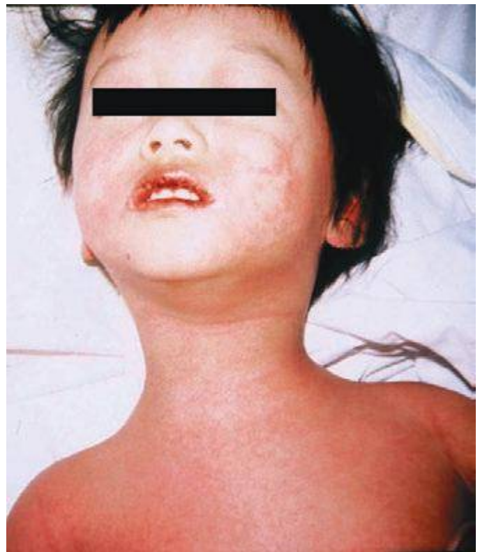
FIGURE 25e-30 Fissuring of the lips and an erythematous exanthem are evident in this patient with Kawasaki disease.