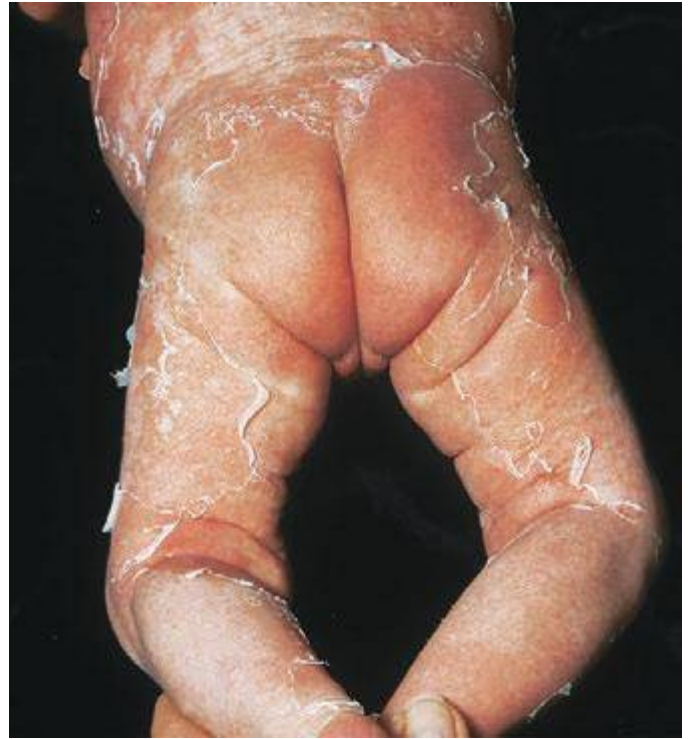
FIGURE 25e-29 This infant with staphylococcal scalded skin syndrome demonstrates generalized desquamation. (Reprinted from K Wolff, RA Johnson: Color Atlas and Synopsis of Clinical Dermatology , 6th ed. New York, McGraw-Hill, 2009.)