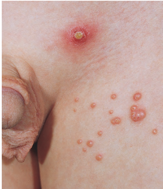
FIGURE 11-23 ■ Molluscum contagiosum. A single lesion (or multiple lesions) may become inflamed and then disappear.