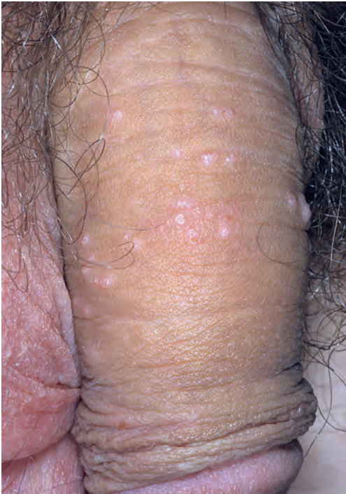
FIGURE 11-21 ■ Molluscum contagiosum must be examined closely to differentiate them from warts, especially in the groin area.