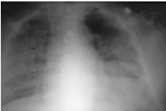
E-FIGURE 22-2 Chest radiograph of a patient with acute respiratory distress syndrome shows diffuse alveolar infiltrates.