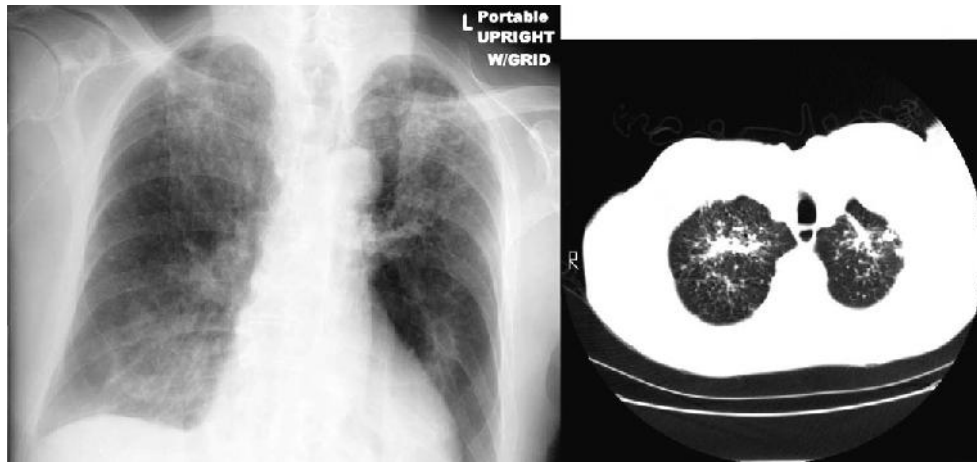
E-FIGURE 17-7 Architectural distortion of the upper lobes in a patient with silicosis.