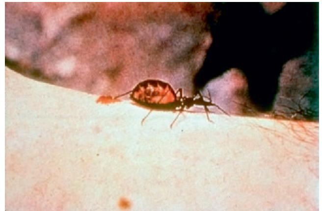
E-FIGURE 103-5 Reduviid bug ("kissing bug") on the skin.