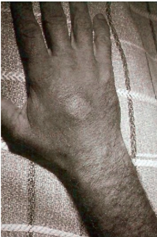
E-FIGURE 103-2 African trypanosomiasis chancre.