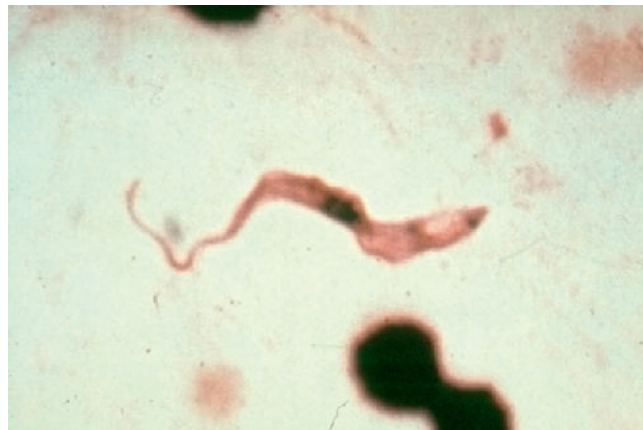
E-FIGURE 103-3 African trypanosomiasis blood smear.